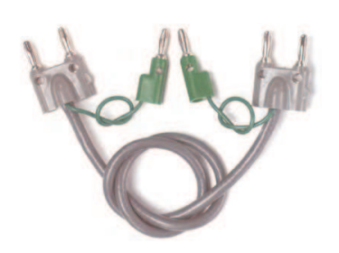
CAB-018: Cable, Multi-stacking Double Banana plug.