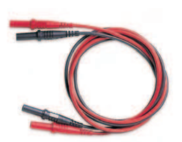
CAB-024: Cable Set, Low Thermal EMF Spade Lug